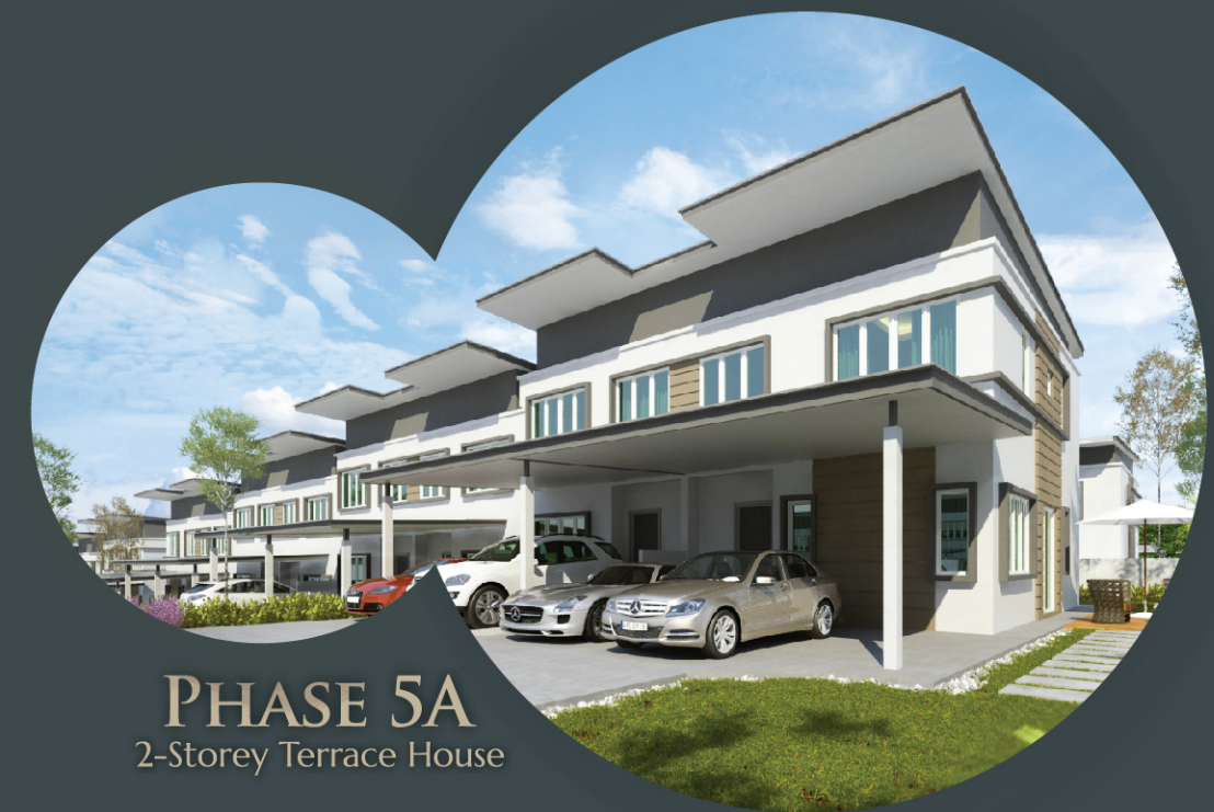
PHASE 5A 2-Storey Terrace House